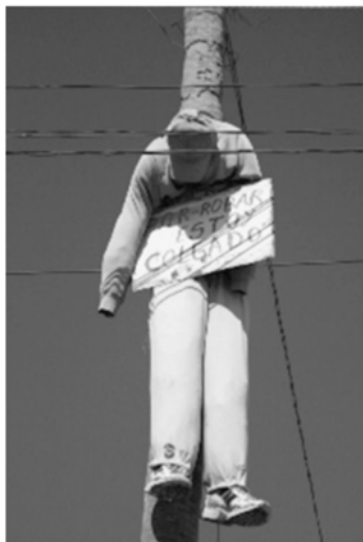
Figure 3.1: A “lynched” Effigy in El Alto, Bolivia (Risor 2010)

Although community justice may have gained legitimacy within the new Bolivian constitution, external, and perhaps even internal, audiences often still associates the justice form with the image captured above. The doll or effigy is one of many scattered throughout the El Alto and function as chilling warnings towards potential thieves or criminals in the area. The message is simple, commit a crime in El Alto and face the fate portrayed by the effigy; in other words, a speedy lynching. The association between community justice and lynching is often strengthened by the press and even Bolivians themselves that often misclassify lynching as a manifestation of community justice. Even the “hanging dolls” themselves threaten passersby with signs warning of “communal justice,” a testimony to the muddled distinction between the two. This association has drawn concern from international human rights organizations, already skeptical of the supposed blank slate granted from the government that support for community justice encourages lynching and other unsanctioned violence.