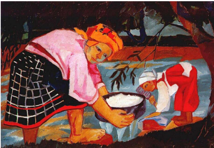
Figure 2- 3 Russkii genii...brocaetsya vniz i khochet slit'sya s zemlei i narodom