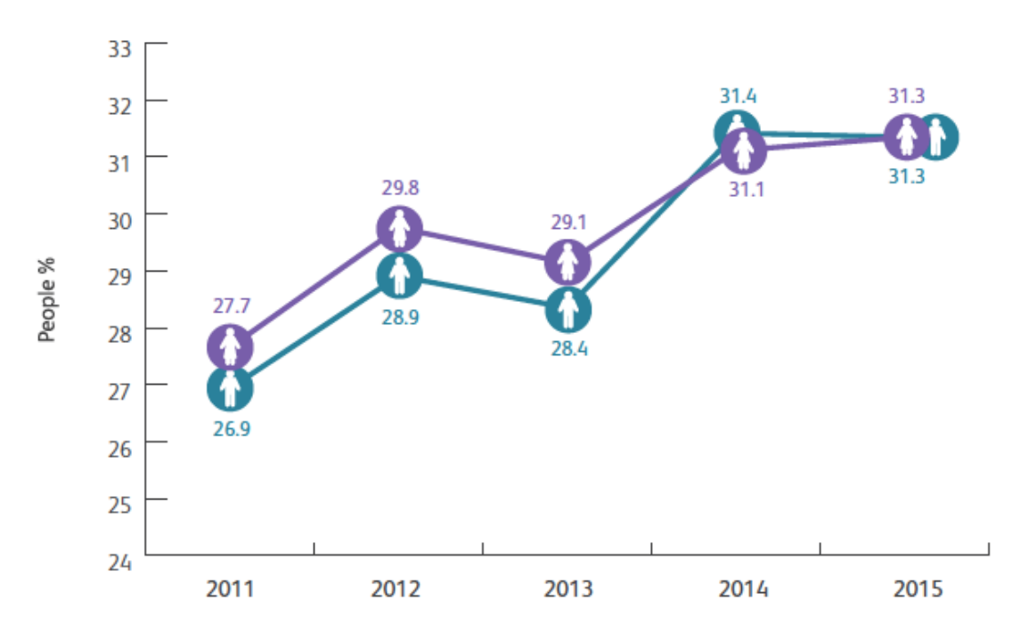
Figure 1. Global participation in donating money, by gender

Most recently though, men and women donated at comparable percentages for data available in the calendar year of 2015 (see figure 1 above). As previously mentioned in the literature review, an interesting divergence occurred between developed and transitioning economies. The percentage of women donating in developed economies was six percentage points higher than men, while the percentage of men donating in transitioning economies was on average one percentage point higher than women.<sup>77</sup> Therefore, the case becomes an interesting one for China. Although more aptly considered a transitioning economy, countries like the United States have lobbied for China to be considered a developed nation in the eyes of the World Trade Organization (WTO) due to its economic might. One trip to Shanghai or Beijing might leave you in