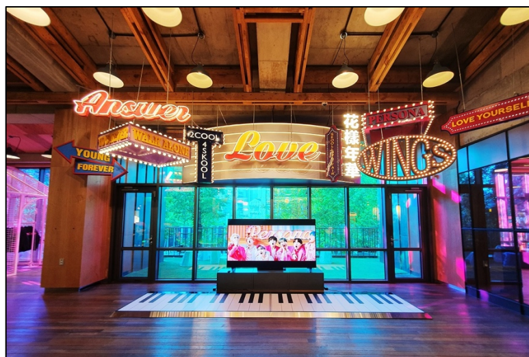
Main Display, Recreated from BTS’s Boy with Luv MV (2019)

and Big Hit Entertainment. One way this is accomplished is the creation of exhibits modeled after spaces in BTS music videos. No area is without reference (both subtle and explicit) to moments in BTS’s career, with most exhibits centered around life-size music video recreations for fans to take pictures in and document on social media; as such, dedicated fans are sure to enjoy the references scattered throughout the pop-up shop. For example, the main display features several LED signs dangling over a giant piano, a reference to sets featured throughout the Boy with Luv music video which was, in itself, packed with references to songs and albums throughout BTS’s career. Other exhibits include a ribbon display from the Idol music video (2018); a bus stop featured on the album cover of You Never Walk Alone (2017); and a giant forest of BTS “cheering sticks,” which—in the BTS fandom—symbolizes the affective bonds created between fans at BTS concerts. As many observers have noted, this particular design rewards fans who have built an intimate knowledge of BTS over the years through continued consumption of BTS music, music videos, merchandise, and more.