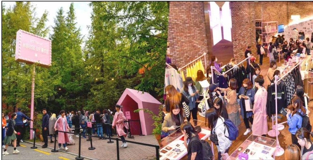
Fans Outside of House of BTS and Inside at the Merchandise Floor (2019)

hundreds of videos created by fans documenting their trip, purchases, and opinions of the event. In watching these videos, I looked for evidence that fans had consumed and were influenced by the videos made by BTS; I also explored the way that fans experienced and responded to the “shared space” provided by Big Hit Entertainment and BTS. The general response from ARMYs who traveled to the store in Gangnam is overwhelmingly positive. The elaborate interior design, complete with interactive exhibits, in fact immediately eliciting excited responses from fans as they passed through the large pink doors onto the first floor.