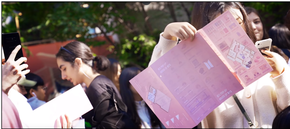
Fan Holding Up the House of BTS Map and Merchandise List (2019)

House of BTS was officially announced in a short, colorfully animated trailer uploaded to YouTube on October 17. Inside the House of BTS, fans can purchase exclusive merchandise including albums, stickers, stationary, clothing, and more. To keep fans coming back for more during the store's 80-day stint—Big Hit Entertainment promised to update the shop with new merchandise, exhibits, menu items, and more each week. Big Hit entertainment officially described the store as "a large-scale multiplex space where one can enjoy BTS contents in a variety of forms" (Soompi News 2019). The three-story shop features a wide variety of attractions to keep fans entertained, including "forest" of ARMY bombs, life-size figurines, and interactive AR technology.