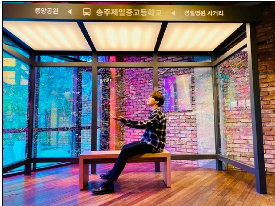
BTS Jimin Posed Next to Fans' Messages (2019)

Moreover, several fans explicitly acknowledged the BTS video series, demonstrating excitement at the idea that they could figuratively experience the space together with BTS—of course, all through the mediation of the camera lens. Fans sought out the various parts of the building where BTS left “evidence” of their visit, especially the written messages left at the bus stop exhibit and the life-size figurines as well. One fan explicitly mentioned how she was “so happy to go [to the store] after BTS” so that she could experience such shared moments. Indeed, we can get some sense of the relationship between affect and profit from these fan clips, as fans often referred to various clothing items in terms of which BTS members wore them in the video series. In that sense, the BTS series effectively produced emotion, meaning, and affect in fans who in turn perceived this store a meaningful space, thereby blurring the line between genuine intimacy/collective bonding on the one hand, and clever emotional or “affective marketing” on the other hand.